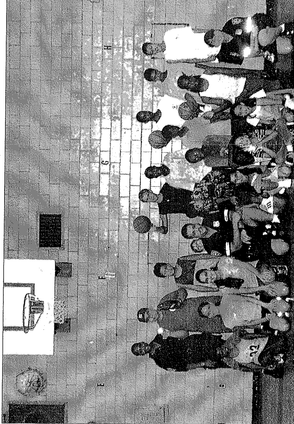
(Below) Participants in the 78th Precinct's Youth Sports League get together for a group photo.