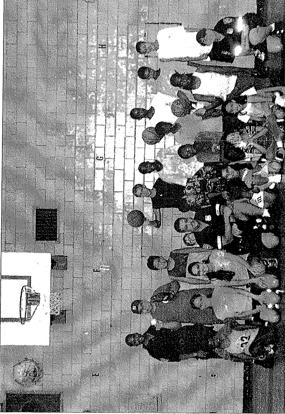
A youth sports league member goes up strong for a layup in the safety of the gymnasium at Middle School 51 in Park Slope.